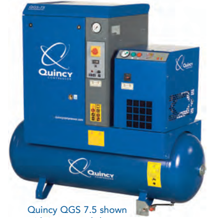
Quincy QGS 7.5 shown with integrated dryer