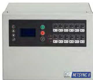
Optional Net$ync II