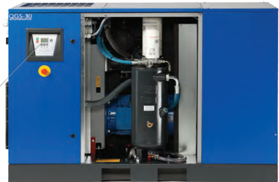
Quincy QGS 30 shown with optional integrated dryer