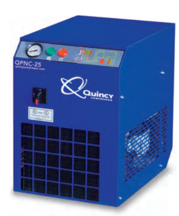
QPNC-25 Non-Cycling Dryer